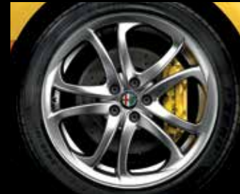
4C Spider offers exclusive wheel designs in 18-inch front /19-inch rear (shown above) and 17-inch front /18-inch rear (at left), in either alloy or dark alloy.