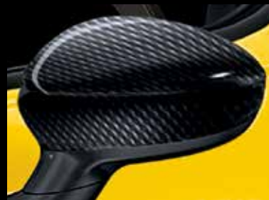
The available carbon fiber mirror covers make objects appear closer in a most stylish way.