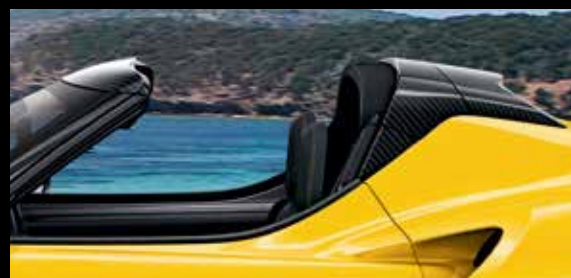
Surround your spectacularly open view with a shimmering carbon fiber windshield surround and carbon fiber halo.

This is open-air performance like nothing you've experienced. The top-down Alfa Romeo 4C Spider introduces a few more elements to the 4C thrill-ride ... like wind, sun and some gleaming carbon fiber touches. Thanks to the rigid 4C chassis, few structural modifications were needed to unveil the sky above; a carbon fiber windshield surround and carbon fiber halo complement the ultra-light carbon fiber monocoque chassis. The available center-mounted exhaust with carbon fiber surround produces the same, distinctive Alfa Romeo 4C exhaust note - made even sweeter while riding with the top down. It's an unfiltered recital that is pure music to our driver's ears*. Designed exclusively for the 4C Spider, the soft top can be easily removed, folded and stowed in a dedicated case in the trunk. An available carbon fiber hard top further adds to the seduction. Personalize your 4C Spider with a choice of seven scene-stealing exterior colors - including the exclusive new Yellow, six wheel choices and four brake caliper colors.