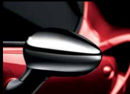
Get a second look with wing mirror covers available in carbon fiber, body-color or Satin Titanium finishes.

The Alfa Romeo 4C Coupe offers awe-inspiring mechanics and design, and gives owners options to personalize their ride by offering exquisite exterior color choices, a variety of fabric and leather-trimmed interior options, different wheel styles and sizes — even different brake caliper colors. It's how to make the arrival of Alfa Romeo all your own.