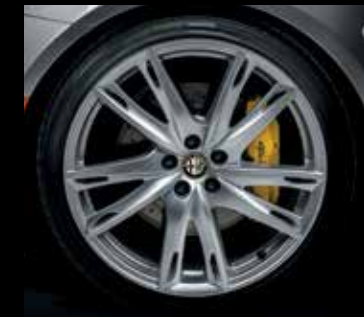
Express yourself with your preferred wheel style: 17-inch/18-inch alloy or alloy with Matte Black diamond finish, or 18-inch/19-inch five-hole alloy or five-hole dark alloy. Brake calipers add a dash of color, available in your choice of Gray, Red, Yellow or Black.