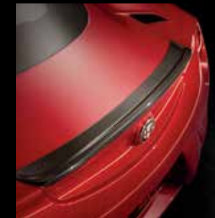
Further customize your Alfa 4C with a rear spoiler, available in matching body-color or carbon fiber finishes.