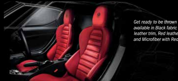
Get ready to be thrown back in race-ready seats, available in Black fabric with Red stitching, Black leather trim, Red leather trim, and Black leather and Microfiber with Red stitching.