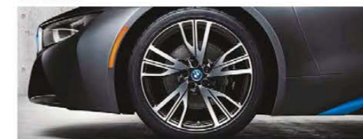
W Spoke 20" – Style 470 with mixed tires