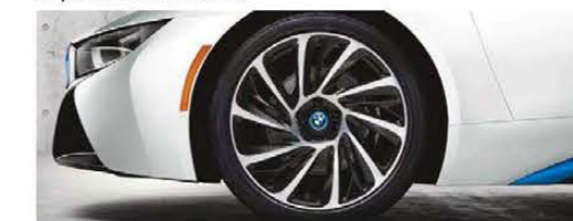
Turbine 20" – Style 625 with mixed tires

Leather upholstery: Leather on all seating surfaces; other components may be Leather or SensaTec. Wheel and tire specifications are subject to change. Get the latest information on BMW standard and optional features, packages and technical specifications. Visit bmwusa.com , select the BMW model of your choice, and click on "Features & Specs."