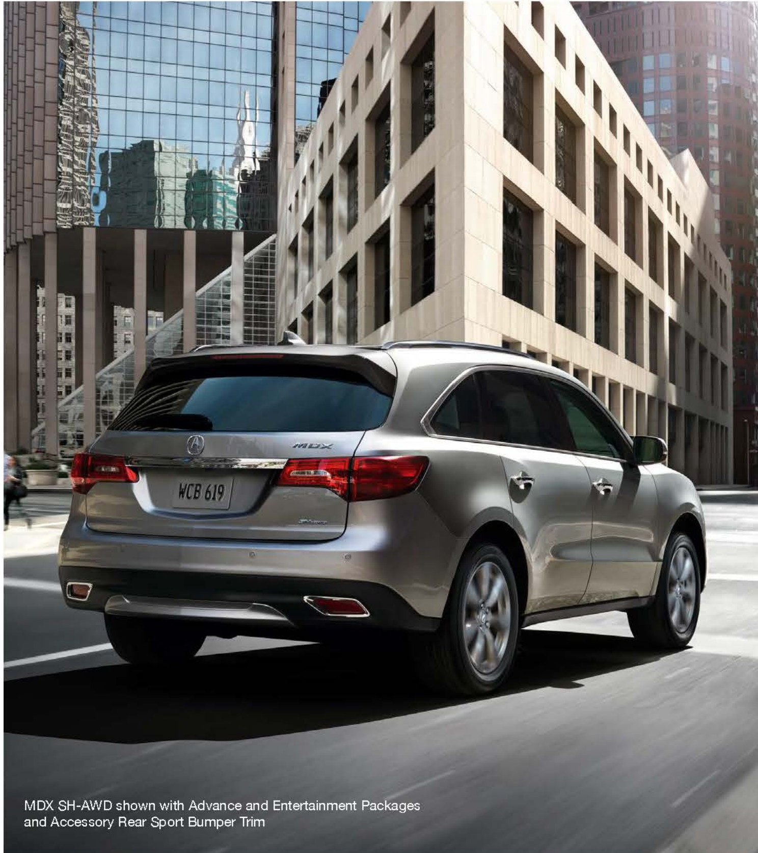
MDX SH-AWD shown with Advance and Entertainment Packages and Accessory Rear Sport Bumper Trim