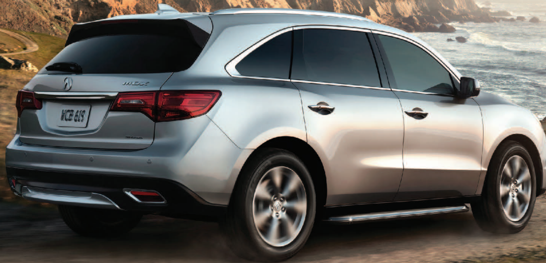
MDX SH-AWD shown with Advance and Entertainment Packages, Accessory Rear Sport Bumper Trim and Advance Running Boards