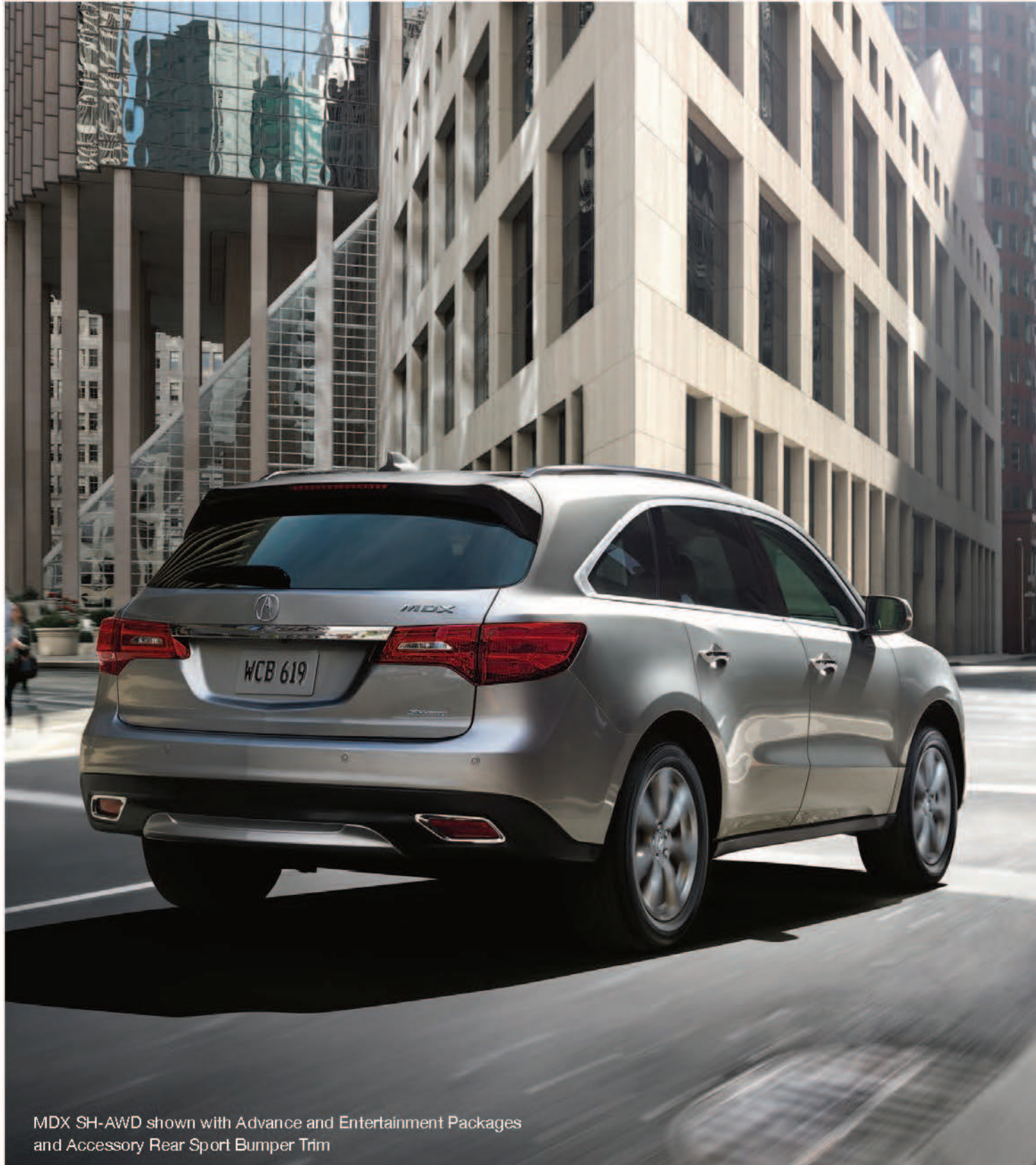
MDX SH-AWD shown with Advance and Entertainment Packages and Accessory Rear Sport Bumper Trim