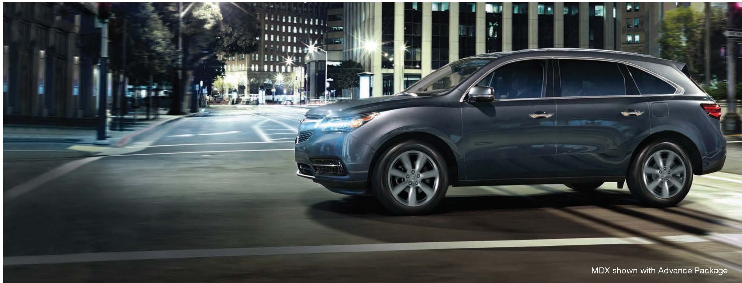
MDX shown with Advance Package