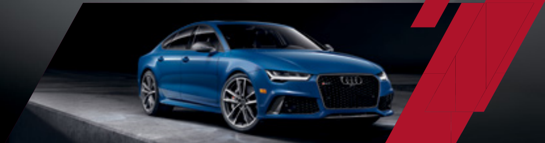
RS 7 / RS 7 performance