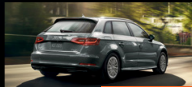
A3 Sportback e-tron®