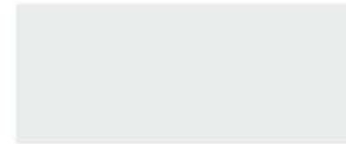
300 Alpine White (Non-metallic)