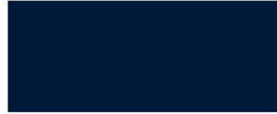
A89 Imperial Blue Metallic