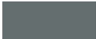
C26 Magellan Gray Metallic