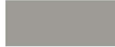
A72 Cashmere Silver Metallic