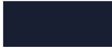
416 Carbon Black Metallic¹