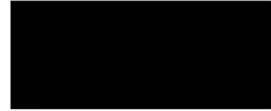
475 Black Sapphire Metallic