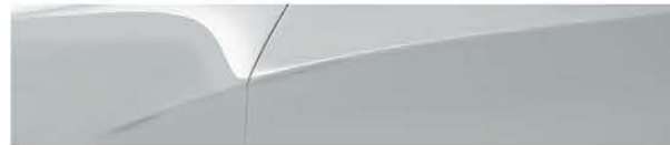
A83 Glacier Silver Metallic