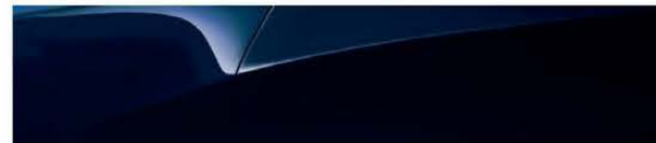
A89 Imperial Blue Metallic