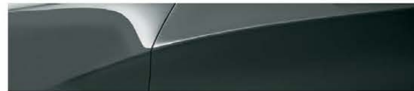
A52 Space Gray Metallic