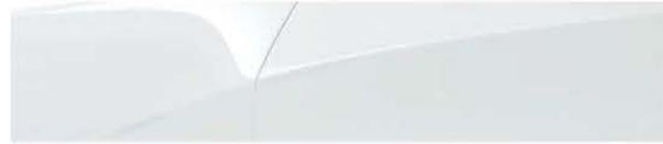
300 Alpine White (Non-Metallic)