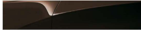
B53 Sparkling Brown Metallic