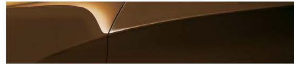
C29 Chestnut Bronze Metallic