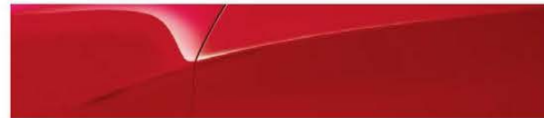
C06 Flamenco Red Metallic