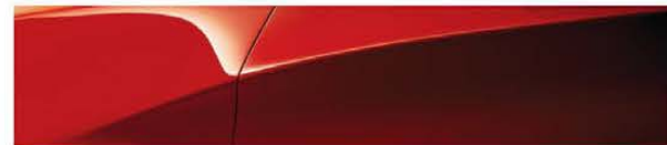
A75 Melbourne Red Metallic