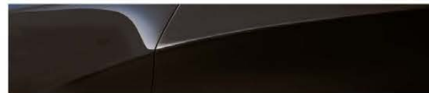
A90 Dark Graphite Metallic