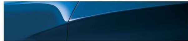
C10 Mediterranean Blue Metallic