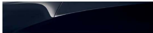
475 Black Sapphire Metallic