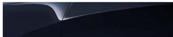
416 Carbon Black Metallic