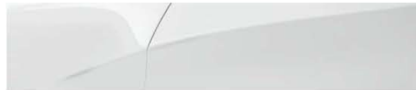
A96 Mineral White Metallic