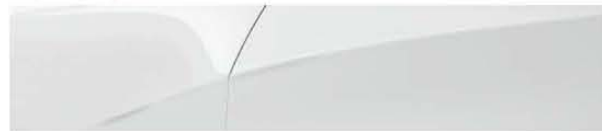
A14 Mineral Silver Metallic