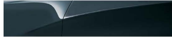
B39 Mineral Gray Metallic