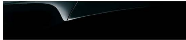
668 Jet Black (Non-Metallic)