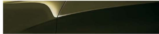
C07 Dark Olive Metallic