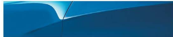
B45 Estoril Blue Metallic