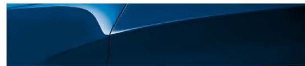
A76 Deep Sea Blue Metallic