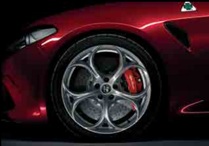
19-inch 5-hole Light Aluminum