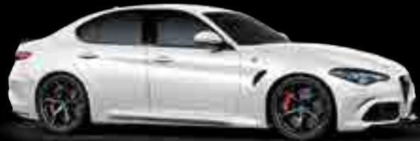
Trofeo White Tri-Coat