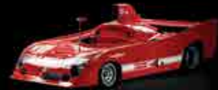
1975 — Tipo 33 TT12 Dominates "Mondiale Marche"