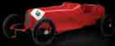
1923 — RL Targa Florio Dominates the competition — the Quadrifoglio is born

This marked the beginning of a tradition: all future Alfa Romeo race cars would bear the four-leaf clover on a white triangle — with the missing corner symbolizing the loss of Sivocci. Post-World War II, the Quadrifoglio was also used to designate high-performance Alfa Romeo street vehicles like the 1963 Giulia TI Super, the 1965 Giulia Sprint GTA and now, the all-new Giulia Quadrifoglio. Today, Sivocci's clover remains a symbol of race-worthy capabilities and, of course, a symbol of good luck.