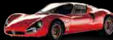
1967 — 33 Stradale Called the most beautiful car of all time