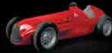
1951 — GP Tipo 159 "Alfetta" Wins the first two Formula 1 World Championships