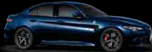
Montecarlo Blue Metallic