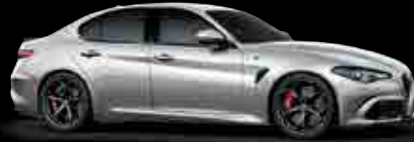
Silverstone Gray Metallic