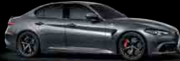
Vesuvio Gray Metallic