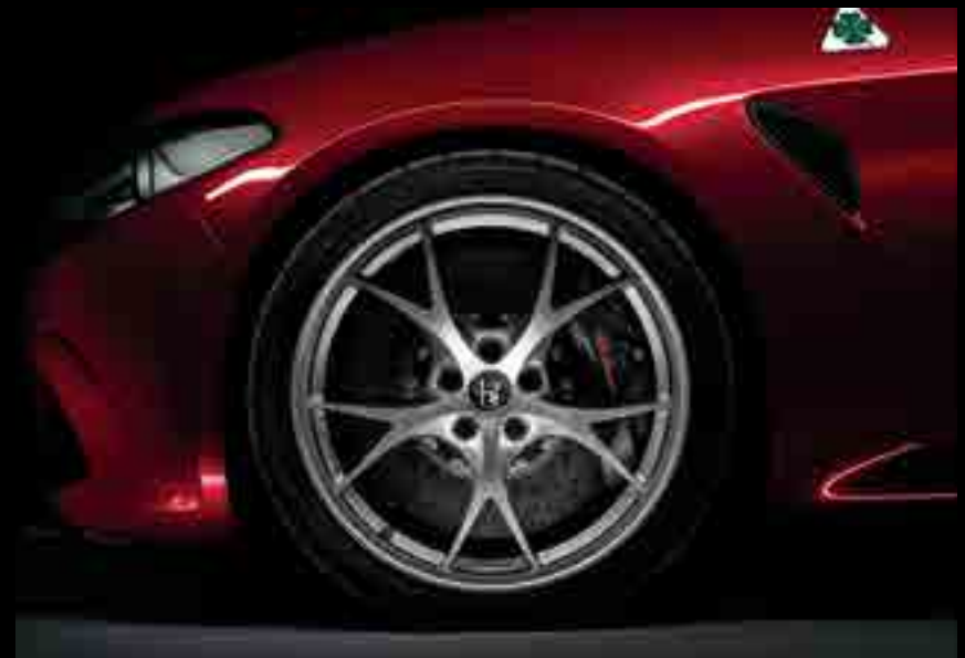
19-inch Tecnico Light Forged Aluminum