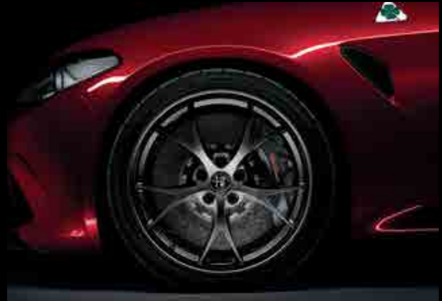
19-inch Tecnico Dark Forged Aluminum