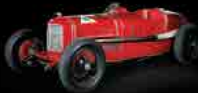
1925 — Gran Premio Tipo P2 The first World Champion ever