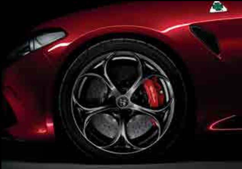
19-inch 5-hole Dark Aluminum