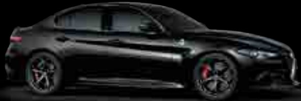
Vulcano Black Metallic