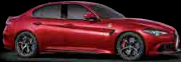
Rosso Competizione Tri-coat