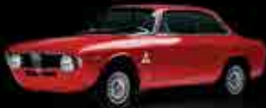
1965 — Giulia Sprint GTA Unbeatable among "Turismo"