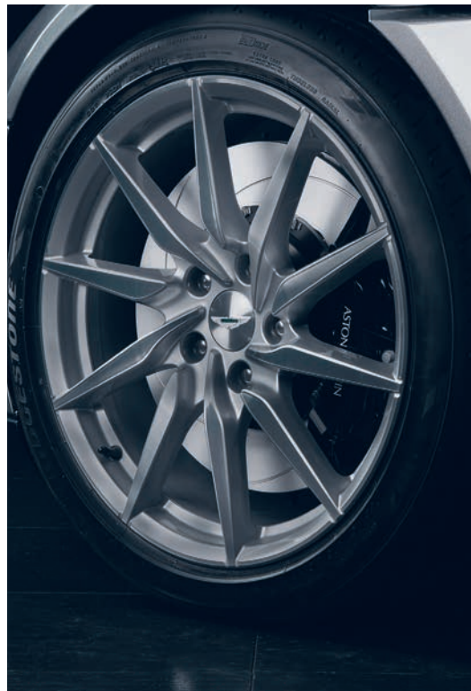
Winter Wheel and Tyre Kit