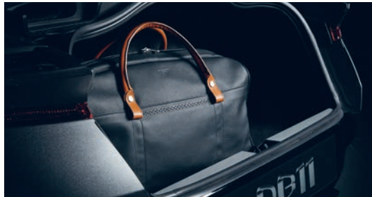
4-Piece Luggage Set