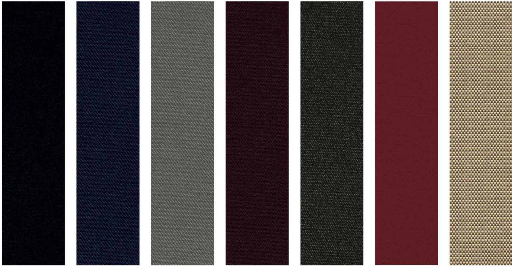
Black Blue Grey Dark Brown* Dark Grey Metallic* Claret* Tweed*