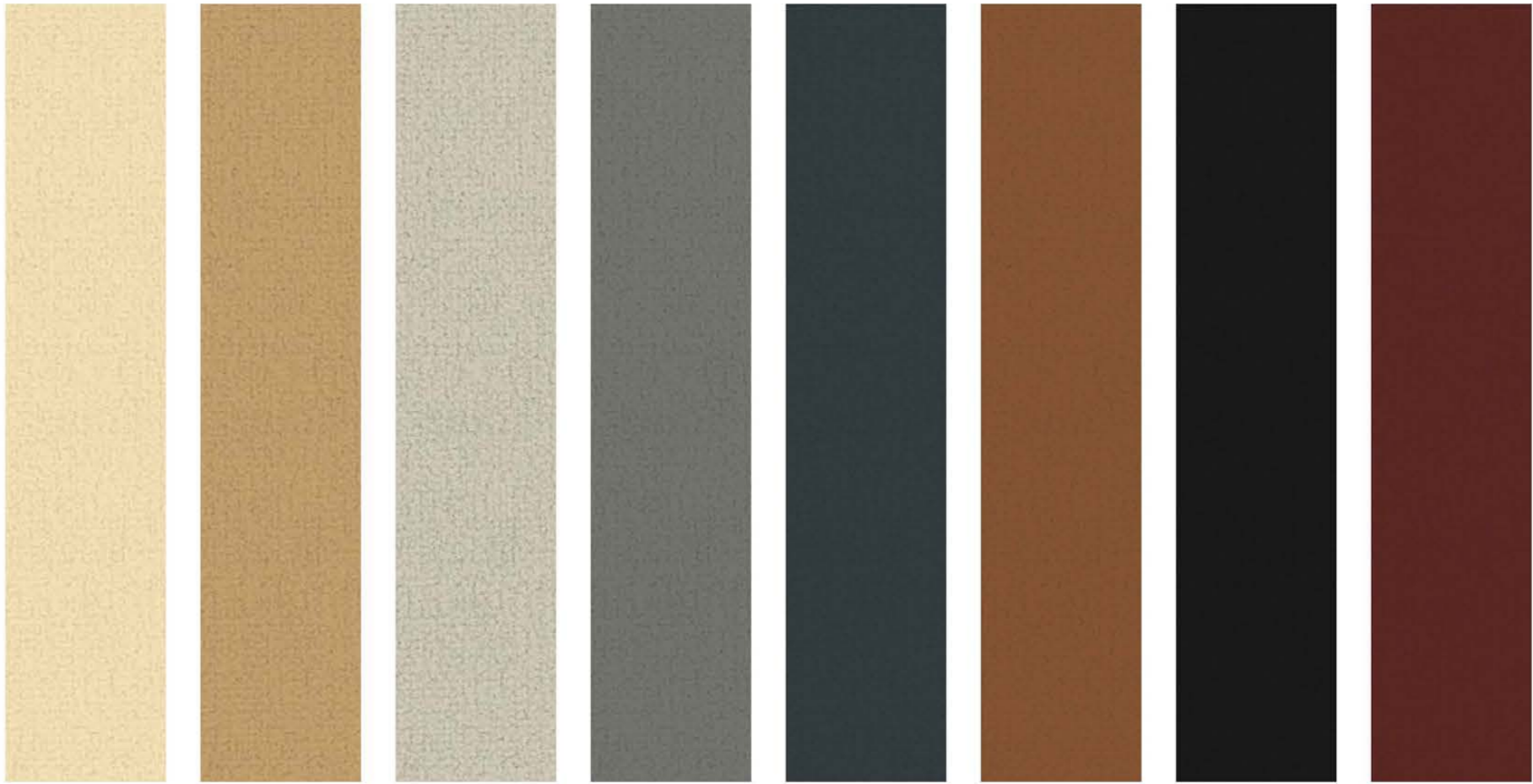
Magnolia Camel Light Grey Grey Blue Saddle Beluga Red